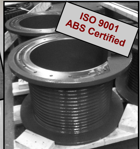
Machining & Paint